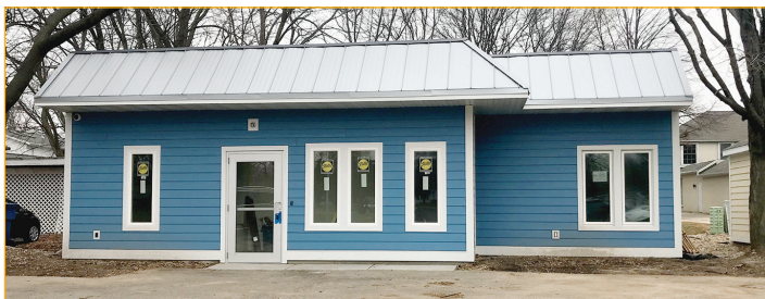
Our new home at 7425 University Ave. in Middleton WI.

We had two full and successful workshops in 2019 with a growing number of students/artists. We sang, danced, created improv scenes and did fun visual projects at our gathering table. 2020 started with a full workshop in February but in March we faced the realities of Covid-19.