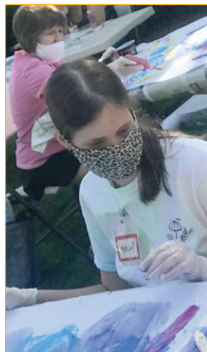
Summer Camp 2020