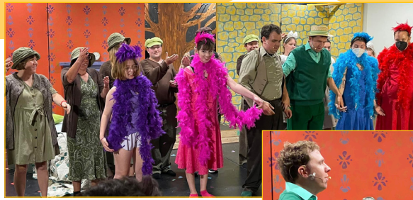
The cast takes a bow after our first performance for our families!